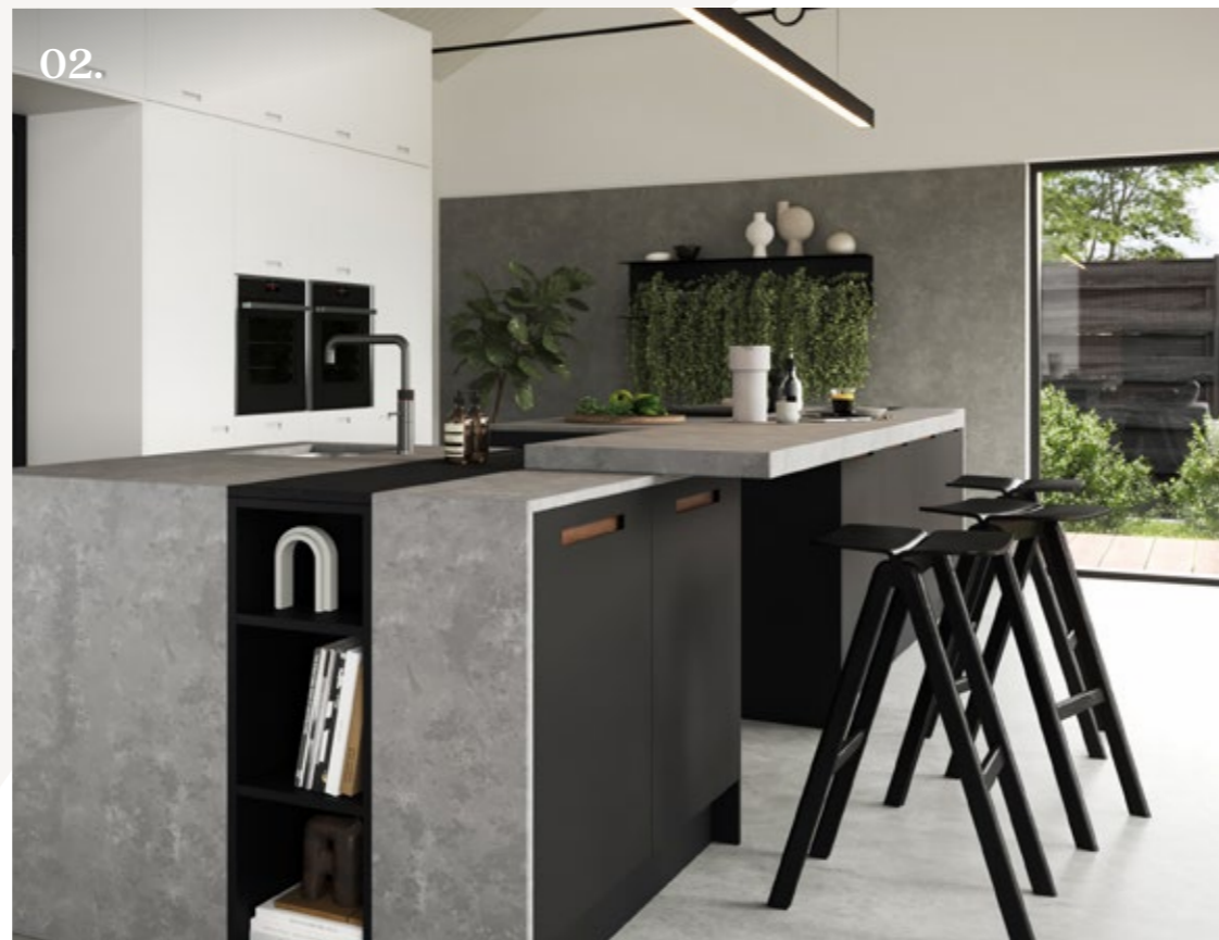
02. A Modern Slab kitchen in Carbon for the island and White for the floor-to-ceiling cupboards.