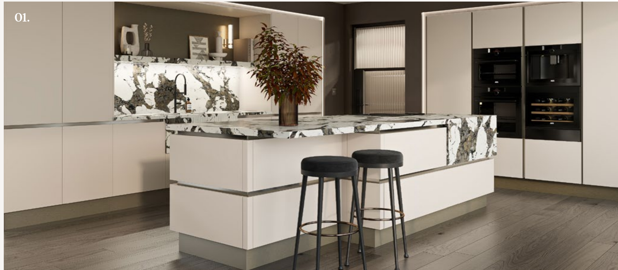
01. Synergy Handleless in Taupe Grey with an island breakfast bar.