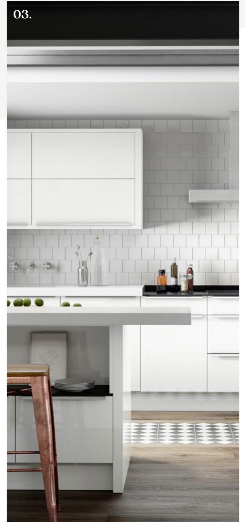
03. Modern Slab kitchen in White Gloss with a matching Laminate worktop for a clean finish.