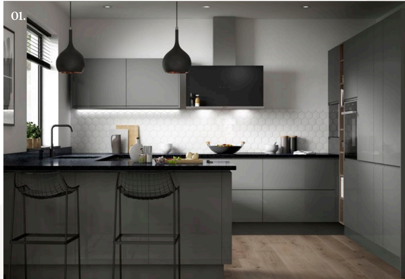
01. Floor-to-ceiling cupboards in Dust Grey to maximise space.

The beautiful simplicity of our Modern Slab range leaves endless design possibilities. Equally perfect for those who like to keep their kitchen minimalistic, as it is for those who prefer vibrant colours and unique statement designs. The vast range of colours, door styles, handle variations and design possibilities allow you to put your own stamp on a kitchen and create a space that is uniquely you.